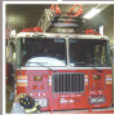
KITUO CHA WAZIMA MOTO